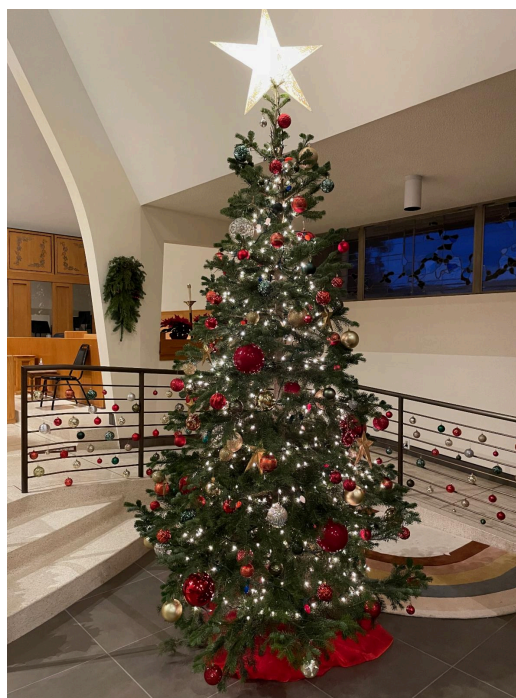
Greening of the Church