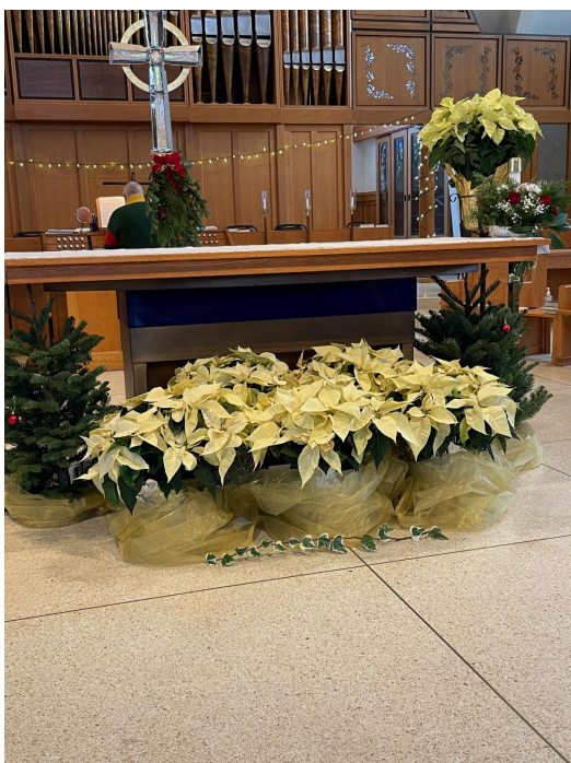
Christmas Greens and Flowers